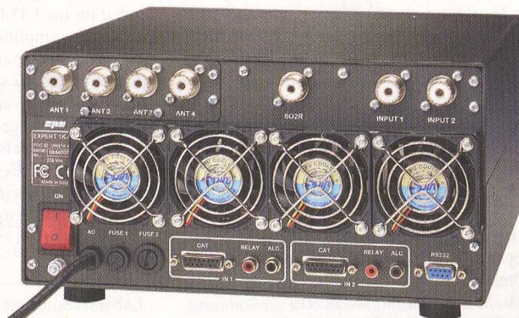
Figure 2 — The rear panel includes connections for two radios and up to four antennas. The four cooling fans, plus three more inside the case, remove heat effectively.